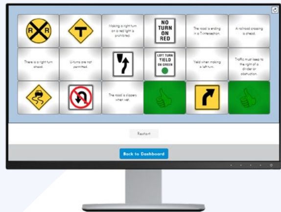
Driver's Ed Online Courses

Course materials are accessible through a third-party, user-friendly LMS and on all devices. Course progress is automatically saved so students can pick up right where they left off. Once they've finished the course, students can take their final test online, and after passing it, will earn their Certificate of Completion from an appropriately licensed school.